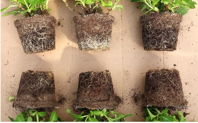
Control, "Lavblaa Blue"