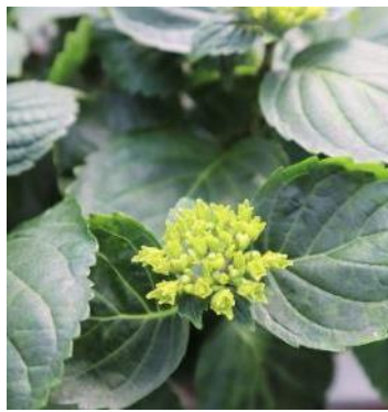
Prestop + Lalstim Osmo